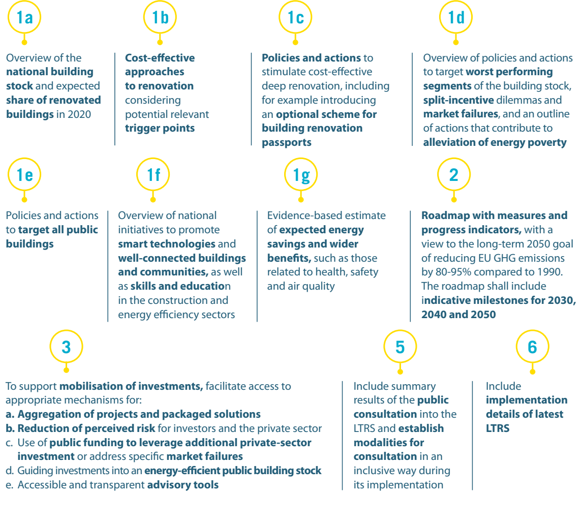
Table 1 - Summary of EPBD Article 2a requirements ARTICLE 2A CLAUSE + REQUIREMENTS

In May 2019, the European Commission also published specific guidance<sup>4</sup> to help Member States preparing long-term renovation strategies.